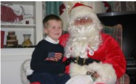
LOOK FOR SANTA'S ANNUAL VISIT TO THE ELMS IN EARLY DECEMBER