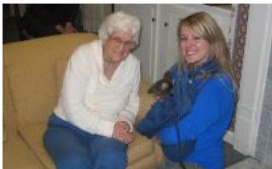
Roger Williams Park Zoomobile's Australian Wallaby