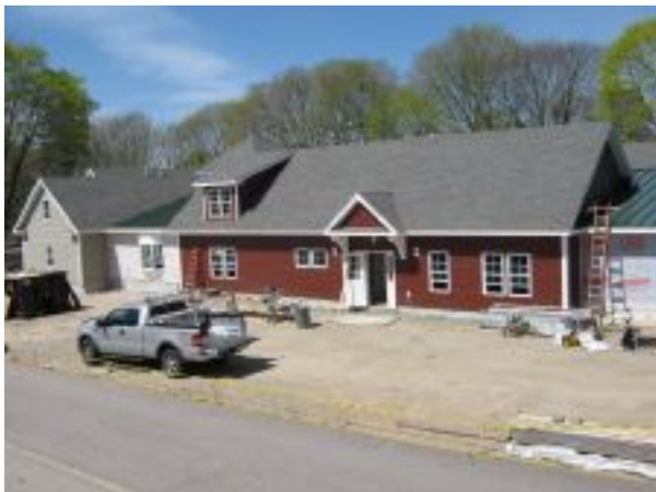
CHESTNUT COTTAGE TO OPEN IN EARLY JUNE